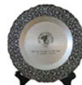
2005 Asia Insurance Industry Award – Service Provider of the Year