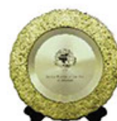
2006 Asia Insurance Industry Award Service Provider of the Year